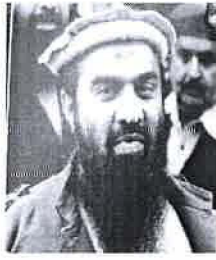
Zaki-ur-Rehman Lakhvi was designated a global terrorist by the UN in December 2008 for being associated with LeT and al-Qaeda

Mumbai attack mastermind and Lashkar-e-Taiba operations commander Zaki-ur-Rehman Lakhvi was sentenced to fifteen years in jail on Friday by a Pakistani anti-terrorism court in Lahore in a terrorism financing case. The court also ordered the seizure of assets worth $200 million (approx. ₹1,600 crore) and a fine of $200 million (approx. ₹1,600 crore) on three counts. The court also ordered the seizure of assets worth $200 million (approx. ₹1,600 crore) and a fine of $200 million (approx. ₹1,600 crore) on three counts. The court also ordered the seizure of assets worth $200 million (approx. ₹1,600 crore) and a fine of $200 million (approx. ₹1,600 crore) on three counts.